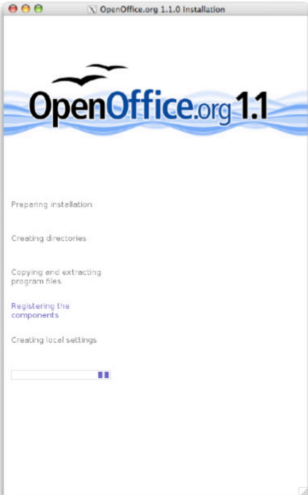
Figure 1 - The actual install process